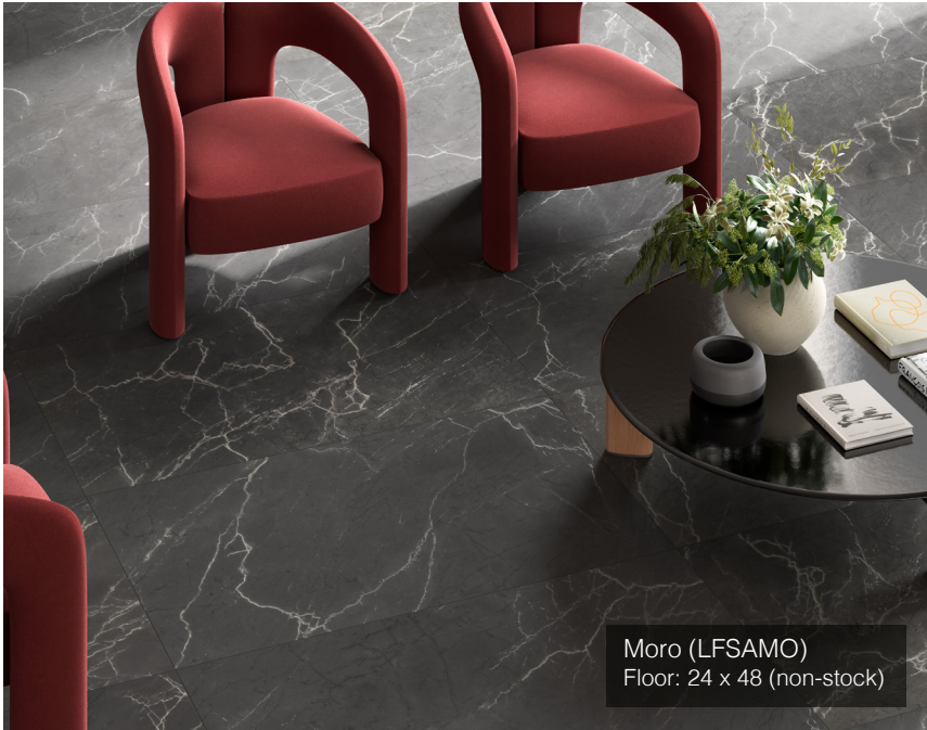
Moro (LFSAMO) Floor: 24 x 48 (non-stock)

Segesta is a classic marble look in 4 colors and multiple sizes. In addition to 12 x 24 and 24 x 48 (in 3 of the colors), it comes in 12 x 12, a size which continues to grow in popularity and a 3" Hexagon which add value to the line and makes it quite complete. The depth of color and distinct veins are expertly rendered to create a look that defines purity and refinement. Colors and sizes can be mixed together to create installations that elevate a space where the look of marble becomes the main character.