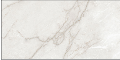
24 x 48