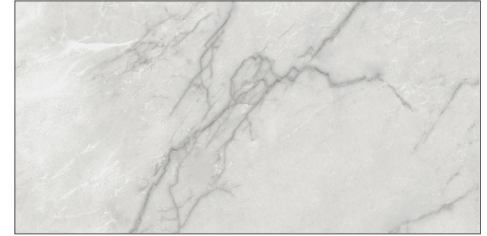
24 x 48