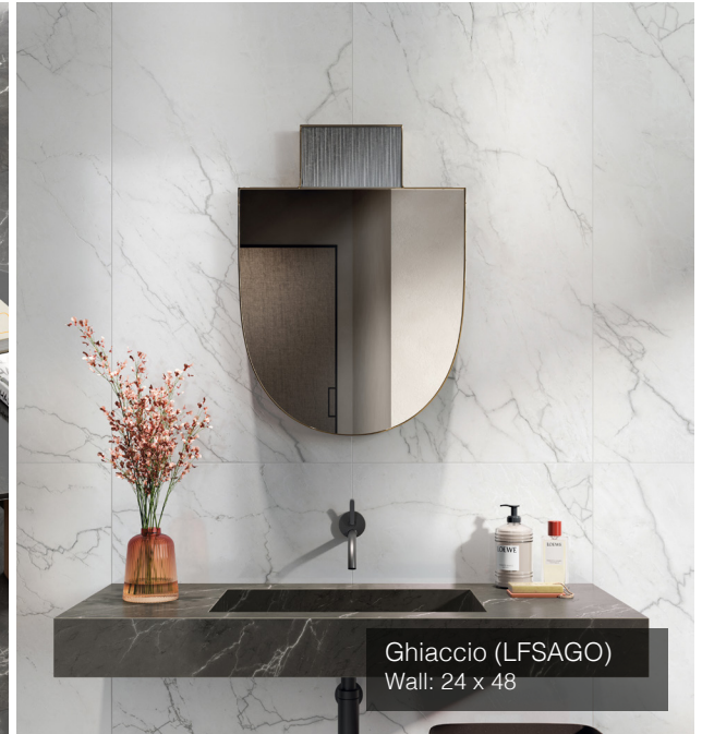
Ghiaccio (LFSAGO) Wall: 24 x 48