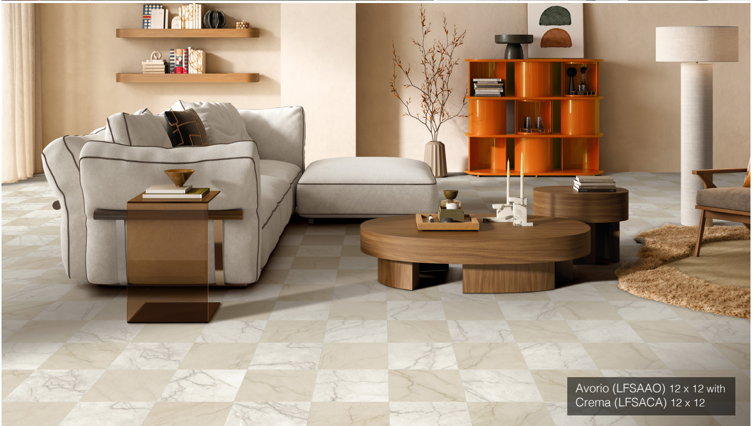
Avorio (LFSAAO) 12 x 12 with Crema (LFSACA) 12 x 12