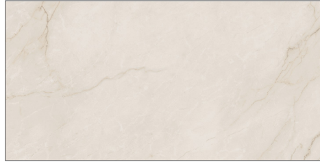
24 x 48